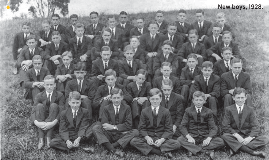
New boys, 1928.