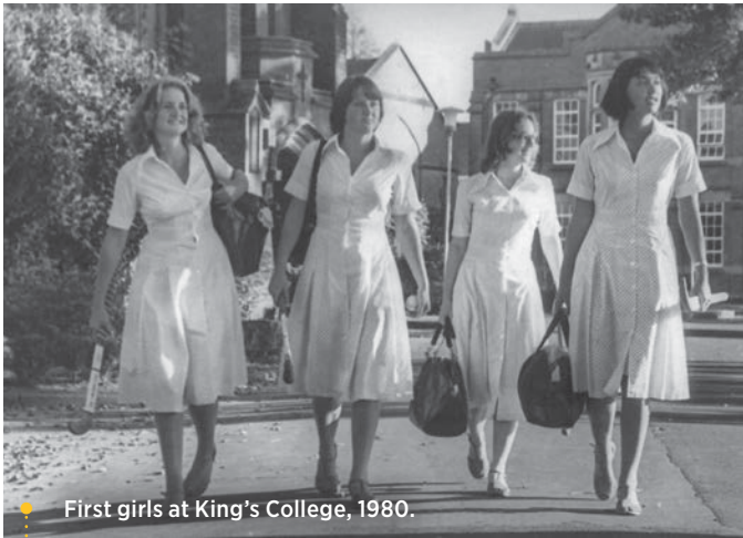
First girls at King's College, 1980.

Steady growth in the roll and an amalgamation with St John's Collegiate saw the College moved from its first site in Remuera (now the site of King's School) to Middlemore in 1922, where it has been located ever since. Many of the College's earliest buildings remain and are central to life at the College, including the Abbott Building and our Memorial Chapel which opened in 1925.