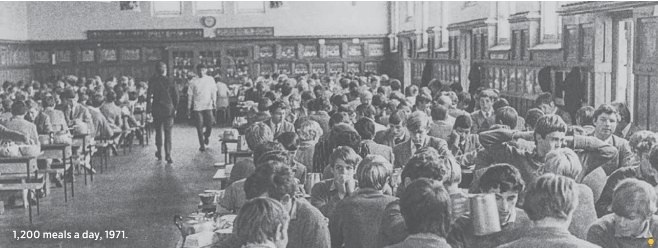
1,200 meals a day, 1971.

Development of new buildings and the evolution of our College site is an ongoing activity as we look to support the success of our students and honour the history of our College.