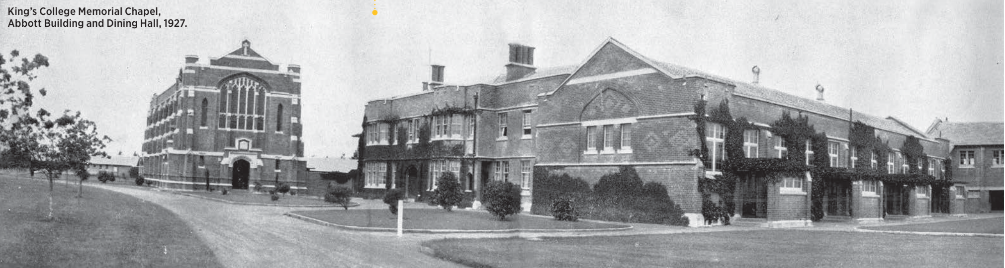
King's College Memorial Chapel, Abbott Building and Dining Hall, 1927.