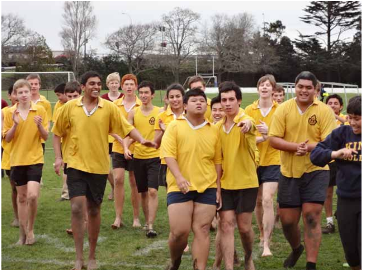
The most memorable moment in 2011. Parnell helps its last senior runner over the line.

Disciplina, Fide, Perservantia Discipline, Faith, perseverance